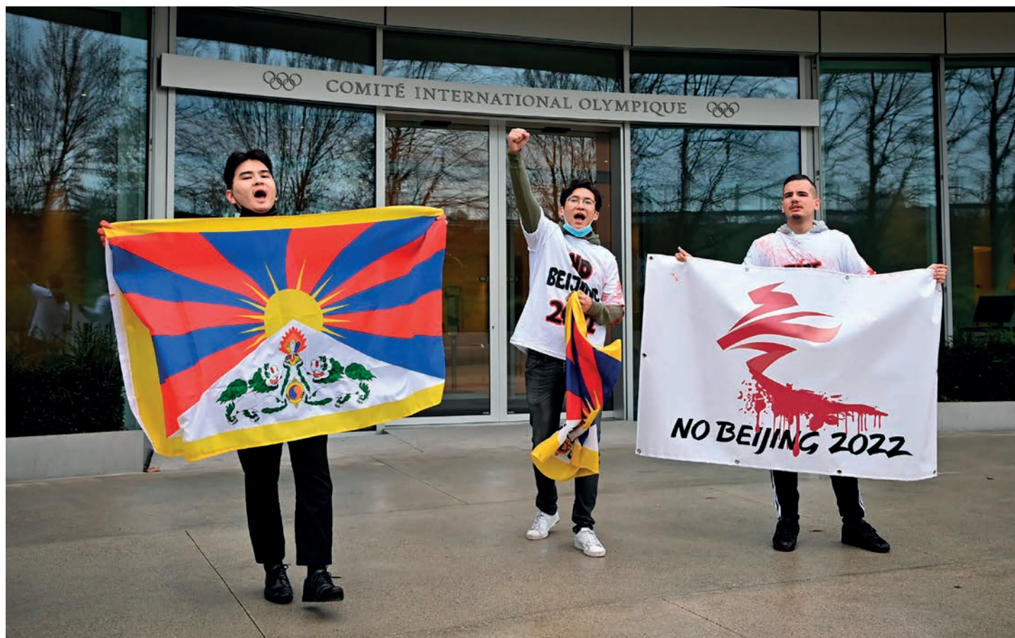
Activists from the Tibetan Youth Association in Europe protest outside the IOC headquarters.

As shown above, the ultimate outcome of this inaction has been expanded crackdowns and ultimately genocide against the Uyghur people, the abolition of a series of civil liberties in Hong Kong and the conversion of Tibet into a police state. Doing nothing is not an option.