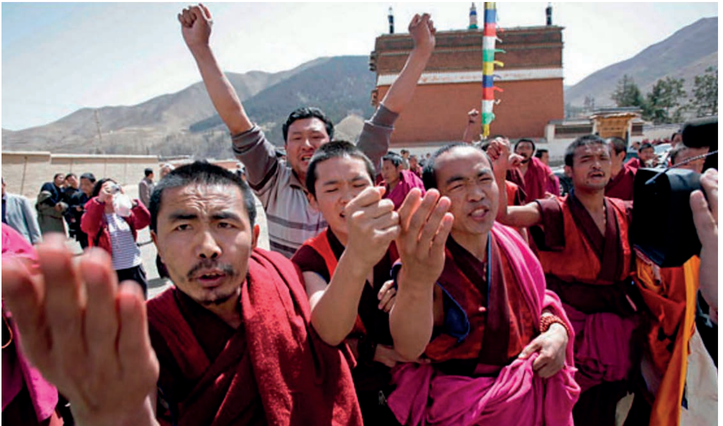
Protest in Labrang, Tibet 2008.