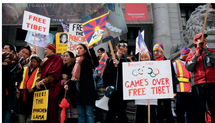
A Tibetan freedom protest in Vancouver before the Beijing Olympics in 2008.