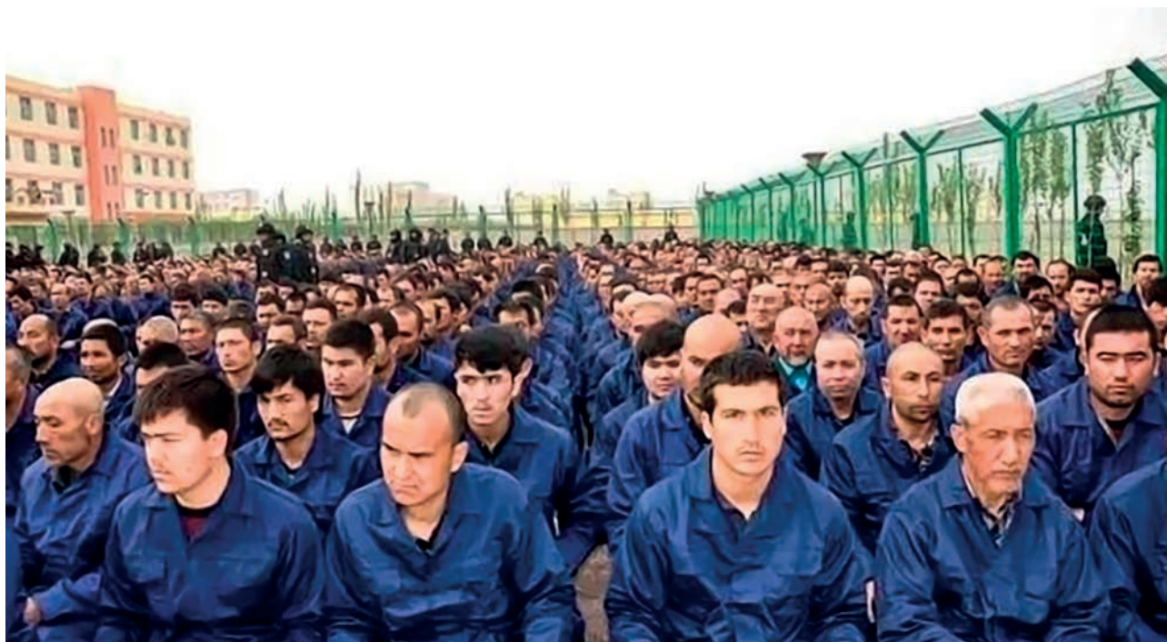
Uyghur Detainees at a re-education camp in 2017.

Most disturbingly of all, work by researchers and testimonies from Uyghur women have revealed the use of forced sterilisations and abortions on hundreds of thousands of Uyghur women. 80 The evidence of forced sterilisation has prompted the United States, Canada, the Netherlands to declare China’s actions against the Uyghurs a genocide. 81