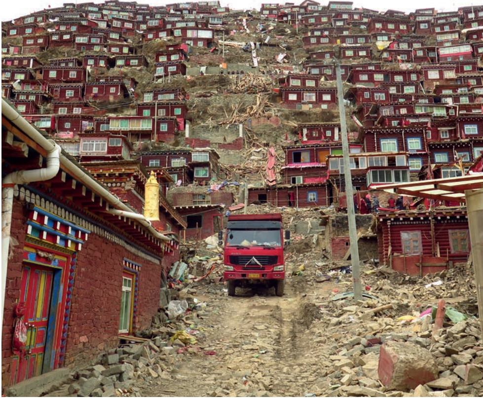
Houses are demolished at Larung Gar in 2017.

Between July 2016 and by May 2017, 4,828 residents were forced out of their homes in Larung Gar . 4,725 buildings were demolished. 38 Those who were removed were required to sign documents stating that they would never return to Larung Gar and were then driven by coach to other regions of Tibet, sometimes over 1,700 kilometres away. These former residents were not permitted to join new monasteries and nunneries upon returning to their native regions. Some of them were subjected to humiliating rituals in which they were made to dance in front of an audience of CCP members or sing Chinese patriotic songs. 39 In the summer of 2016, three nuns took their own lives in protest against the destruction of the site. 40