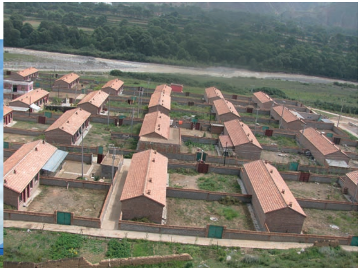
Tibetan herders in Gannan; Nomad resettlement in Rebkong, 2015.

many of those who were relocated were required to sell off some or all of their livestock, while others were left with unmanageable debts. 63 For example, in 2015, hundreds of families from Chone County, north-eastern Tibet were encouraged to sell their livestock and promised compensation. Three years passed without their promised money. In September 2018, 20 Tibetan nomads, including some very elderly Tibetans protested late into the evening by sitting in front of the local government's offices demanding the promised compensation. 64